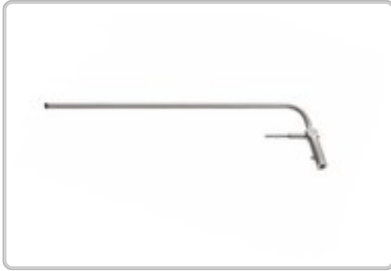
526038 : LIGHT CARRIER TYPE 18H