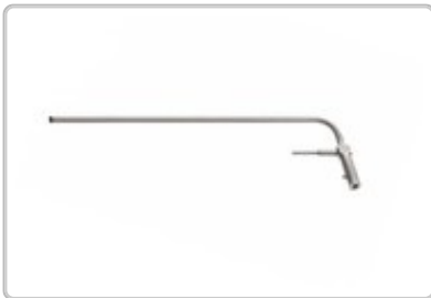
526049 : LIGHT CARRIER TYPE 25