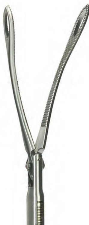
211117A CURVED MASHER GRASPING FORCEPS Thin Teardrop, not designed for use with a 10mm cannula 21cm shaft length, locking