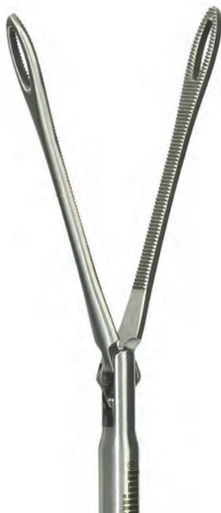
211116A STRAIGHT MASHER GRASPING FORCEPS Thin Teardrop, 10mm Diameter 21cm shaft length, locking