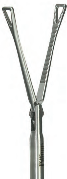
131114A PENNINGTON GRASPING FORCEPS 10mm Diameter 13cm shaft length, locking