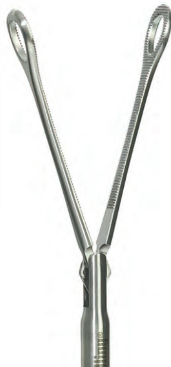
211118A STRAIGHT MASHER GRASPING FORCEPS Round, not designed for use with a 10mm cannula 21cm shaft length, locking